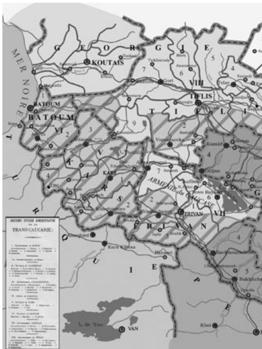
The map of the South Caucasus officially submitted to the Paris Peace Conference (1919)