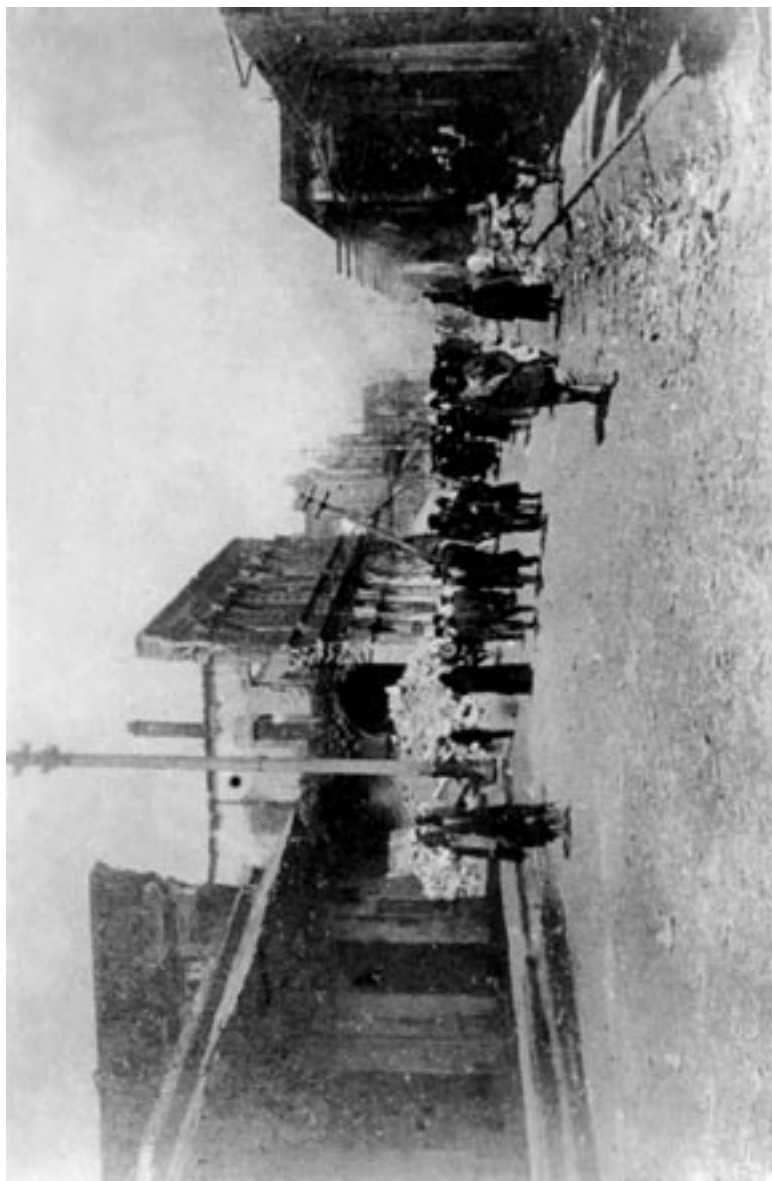
Burned shops on Bazaar street in Baku (March, 1918).