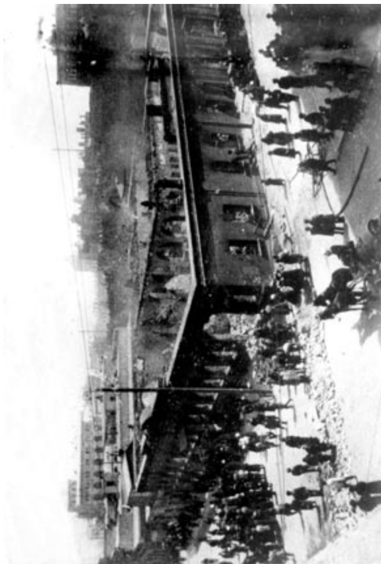
The building and the editorial office of Kaspii newspaper burned and destroyed during the March events of 1918.