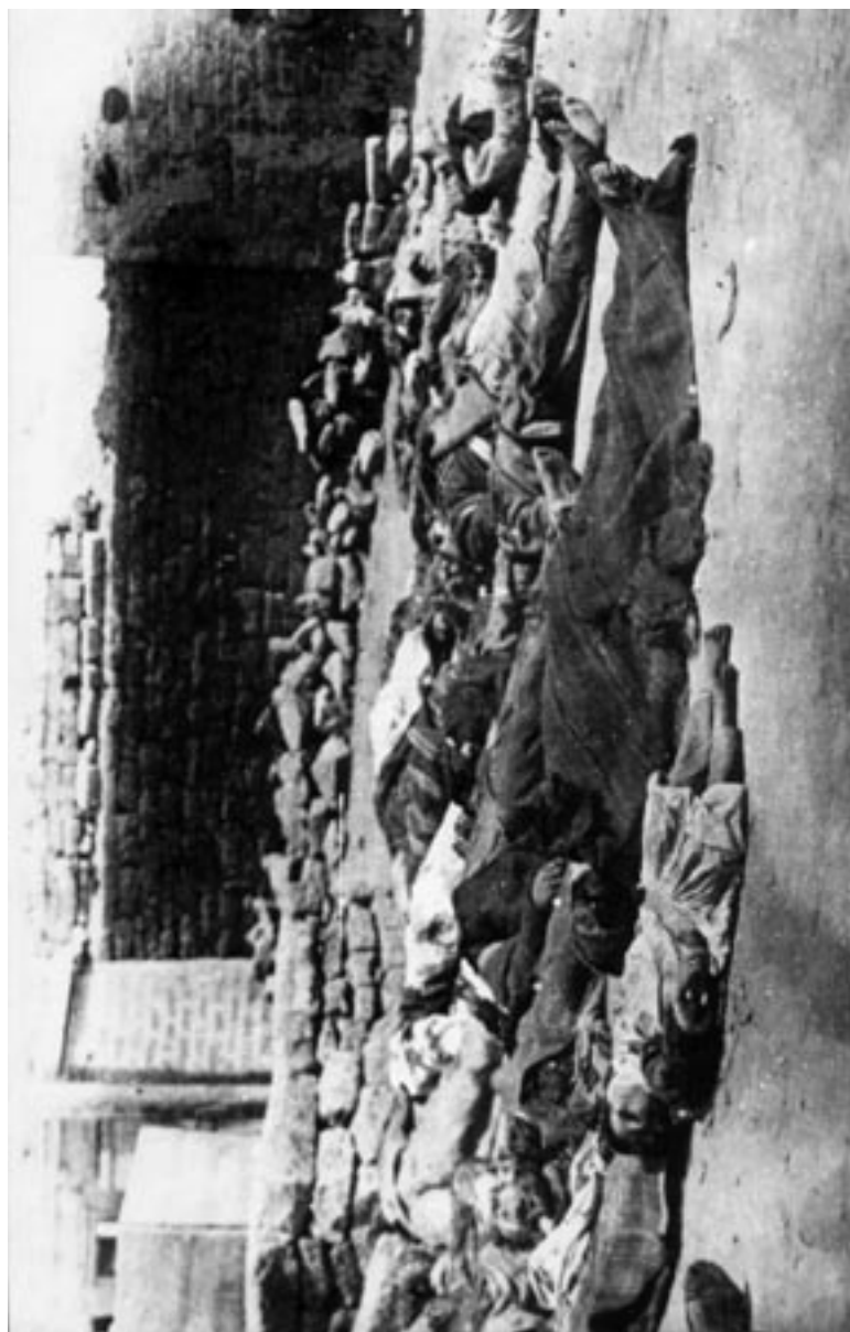
Corpses of Azerbaijani victims of the March massacre in Baku (1918).