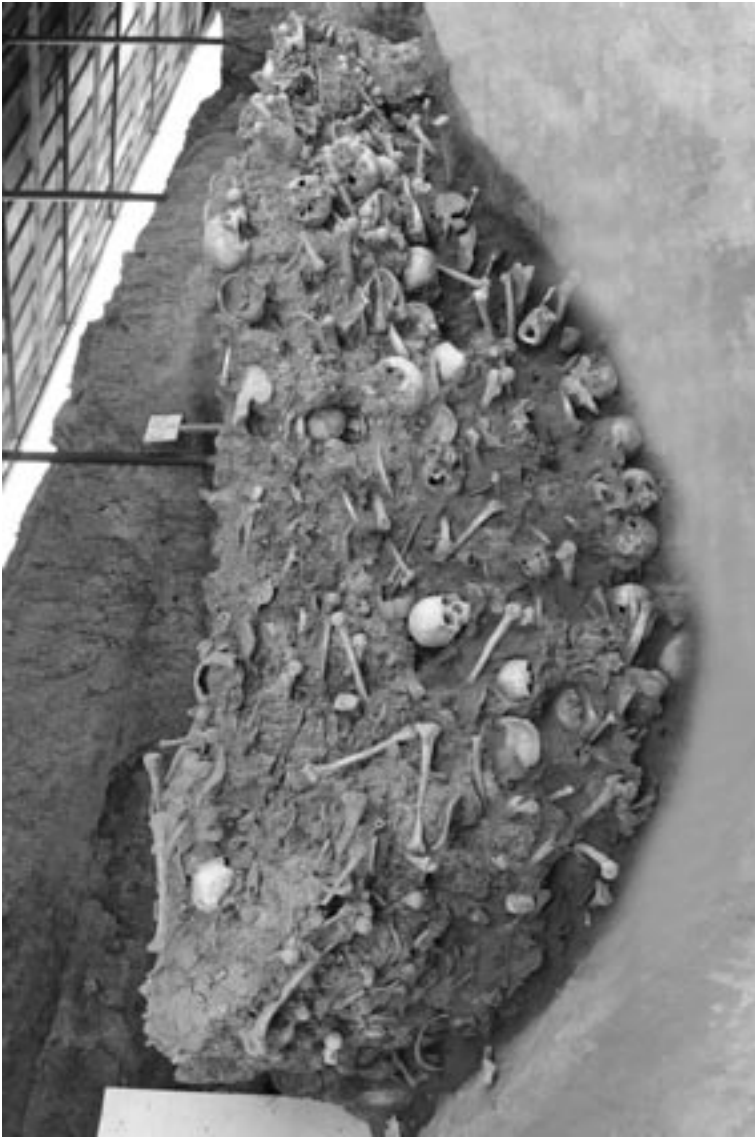
Excavation of a mass grave of 1918 genocide in Guba, Azerbaijan.